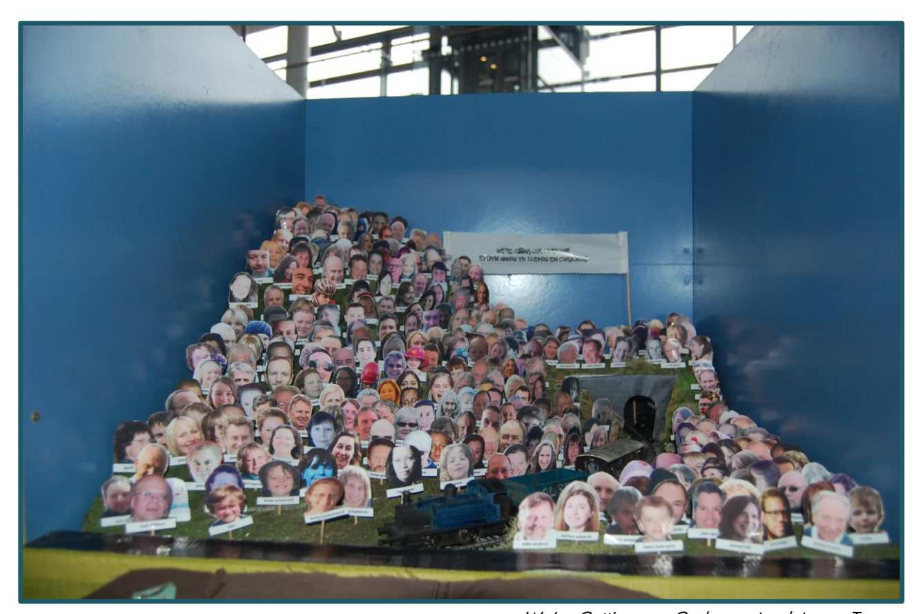
We're Cutting our Carbons, Awel Aman Tawe

This is significant. Small organisations or sole artists working on shoe-string or un-funded projects, with little backing, or support networks, within a field that is in many respects 'taboo' are vulnerable to burnout. Their decision to work across two sectors where there is little funding and limited public respect is a demonstration of their commitment to this emerging field of inquiry. They require support.