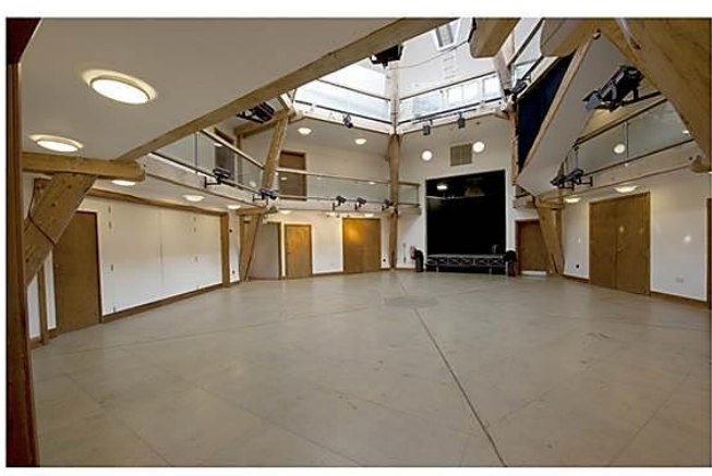
Creating a Sustainable Venue: In Small World Theatre we have built a venue for the arts and a creative community. It is an adaptable space for the organisation to develop new work and grow in strength. It is not just the building that is forging a carbon free future. Many of Small World Theatre's projects are linked to other aspects of environmental awareness, food, development, and culture. The space, our work and our ethos are interconnected.