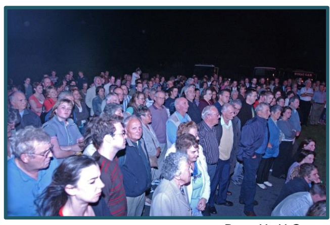
Drwg Yn Y Caws, Gydweithredol/Troedyrhiw