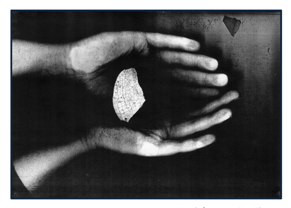
Hands fragment, Fern Thomas

The survey results draw out the issue of content versus practice. The largest group of respondents (almost half) consider sustainability to be vital to both the mission and delivery of their work. However, making improvements in the processes and delivery of artists work by lowering the impact of buildings and facilities is still considered vital, especially since 72% of respondents' work is building based, albeit increasingly in non-traditional arts spaces such as empty shops (Volcano@229 in Swansea, Newport's International Airspace and re:store in Bangor).