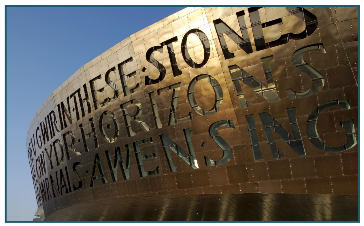
Wales Millennium Centre

Effective dialogue is inherent in any working definition of sustainability, as is diversity and a commitment to resilient local networks and communities. The vision of a sustainable Wales needs to bring everyone into the conversation on an equal footing. We make the recommendation that it would be a fruitful area for further enquiry to assess whether artists working through the medium of Welsh are operating with different terms and practices in relation to sustainable development and how this might contribute to future sustainable practice in the country as a whole.