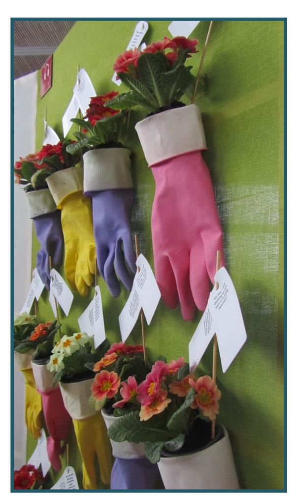
Green Routines, Awe Aman Tawe

The intention was to record specifically the views and experiences of arts practitioners known for their commitment to sustainability. We chose to use a survey to gain a data-driven snapshot of the extent of sustainable arts practice at this moment in time, and to gain further qualitative information through semi-structured interviews and case studies. These helped to inform a more holistic picture of what is currently happening in Wales, and are found referenced and featured throughout the document.