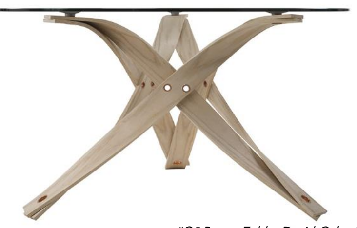
"O" Range Table, David Colwell

Our role is really simple. My role is simple. It is to do things that are relevant to now and tomorrow. To make sure the mythology is relevant, that it moves into the future. With this environmental issue - it's much bigger than that because it goes through idiot labour and all of these things - this is what you can do. And isn't this MUCH more interesting?